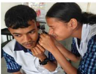
Image 12: Student using an otoscope for ear examination.