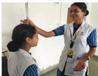
Image 13: Student performing Weber's test on a standardized patient.