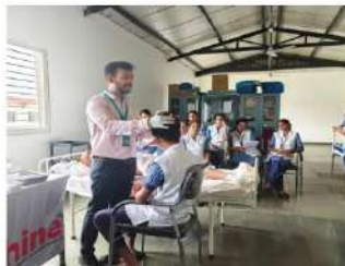
Image 7: Demo – Head-to-Toe Assessment