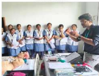
Image 10: Checklist discussion – Respiratory assessment