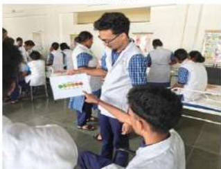
Image 9: Students practicing Pain Assessment